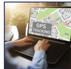
GPS-enabled Transport Tracking