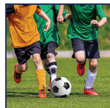
World-class sports facilities with Sportz Village