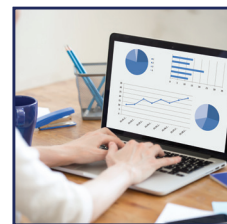
Detailed Student Reports