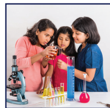
State-of-the-art Hi-Tech Labs