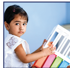
Zero bag policy from Nursery to UKG